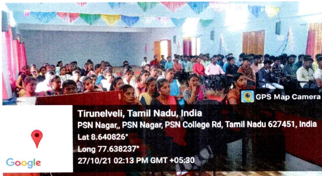
Induction day Program on 27/10/2021