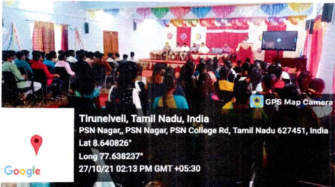
Induction day Program on 27/10/2021